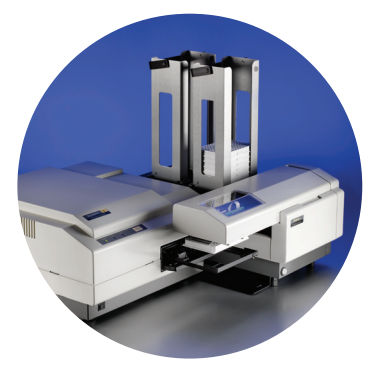
Figure 3. Integrated stacker option. The SpectraMax L reader is easily integrated with the optional StakMax microplate stacker from Molecular Devices for automated multiplate assays.

Figure 2. User-friendly software. SoftMax Pro Software has user-friendly graphing functions and spreadsheet capabilities.